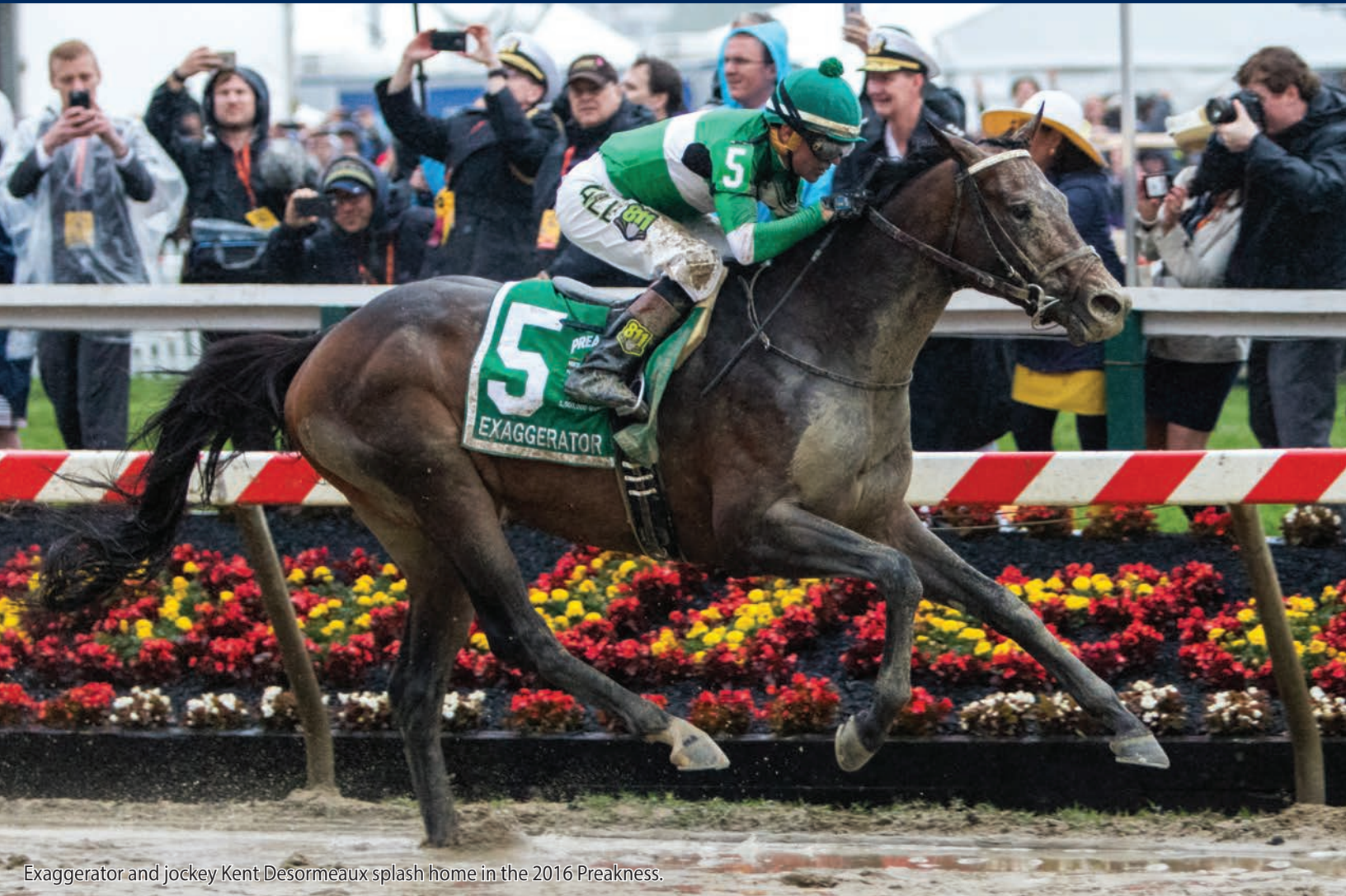
Exaggerator and jockey Kent Desormeaux splash home in the 2016 Preakness.